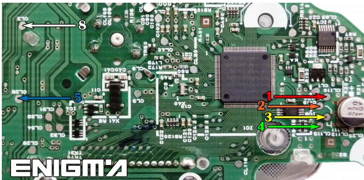
PHOTO 1: Connect cable C7 to the points as shown on the picture above.