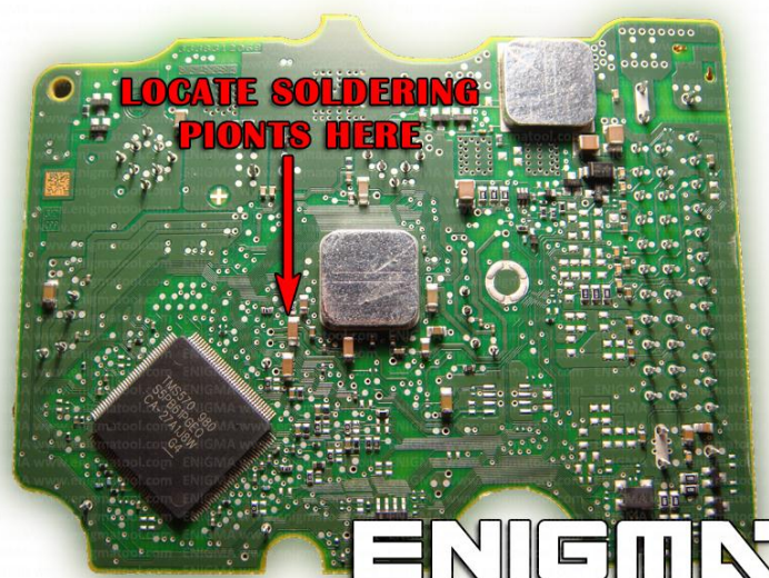
PHOTO 1: Look for connection points like shown on the photo above.

! REMEMBER TO SEAL CORRECTLY THE MODULE AFTER THE WORK IS DONE !