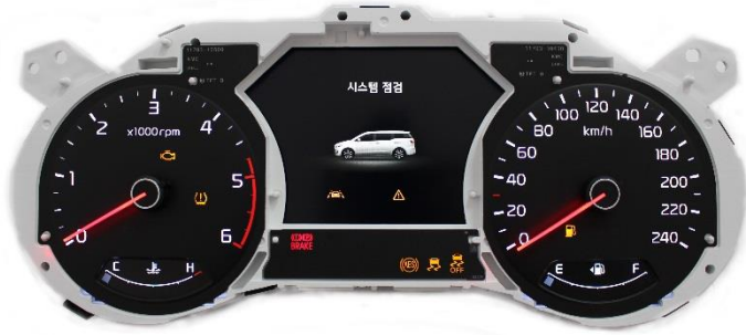
INSTRUMENT CLUSTER FRONT PHOTO